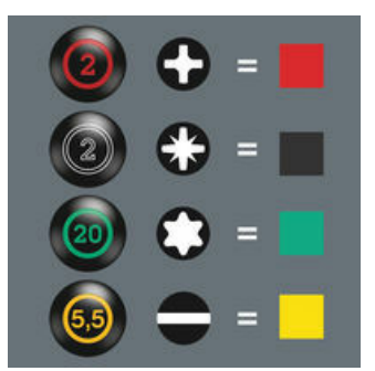
Screwdrivers with "Take it easy" tool finder: colour coding according to profile and size stamp.