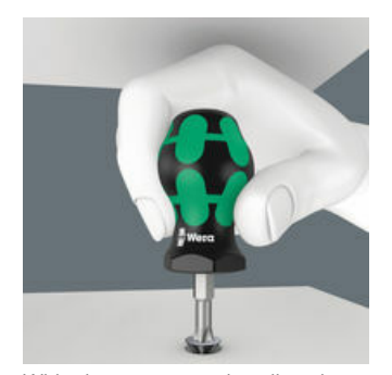
With its compact handle shape and the short blade, the Kraftform Stubbies are particularly suitable for working in confined screwdriving situations.